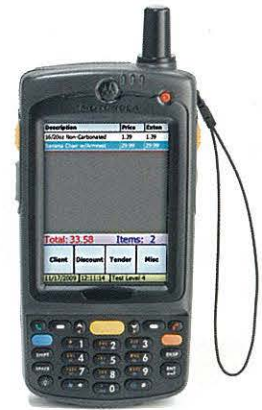
Motorola MC75 with Magstar Mobile POS